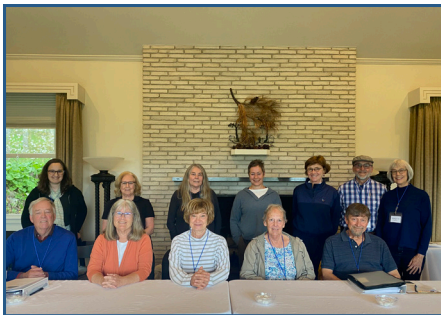
New Friendship Volunteers trained in Lake Placid in May 2024

Over the past year, Mercy Care recruited and trained 24 new Friendship Volunteers. We are most grateful for their generous gifts of time, compassion, and kindness to their Elder Neighbors.