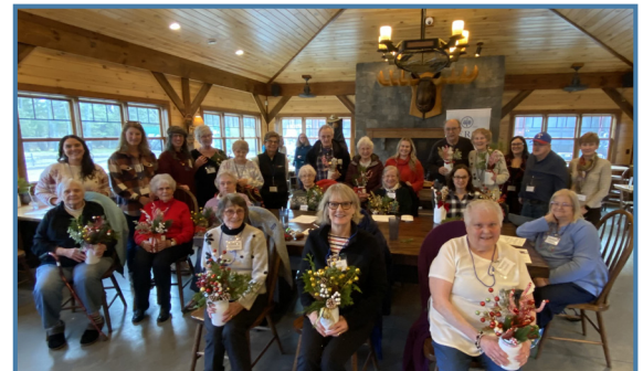
Holiday – Creativity in Aging Workshop

Throughout 2024, Mercy Care hosted Technology Assistance Workshops for our Volunteers, Elders, and members of the community at BOCES in Saranac Lake. These quarterly workshops are led by Mercy Care’s Director of Programs and Mission Integration, Project and Technology Manager, and a Mercy Care Volunteer, an experienced