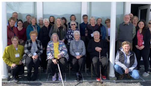
Twenty Spiritual Care Companion Volunteers participated in the March 19, 2025 inaugural program training.

A Spiritual Care Companion Volunteer receives training to accompany an elder on their spiritual journey who may be experiencing loss, grief, spiritual or physical distress, changing living circumstances, joy, or blessings. The Spiritual Care Companion serves as a caring presence and compassionate listener to issues of concern to the elder by being present in mind, heart, and soul to the elder's experience of loneliness, pain, struggle, or joy in telling their story. Mercy Care offers spiritual care in accordance with each elder's personal desires, values, and faith community, or no faith community.