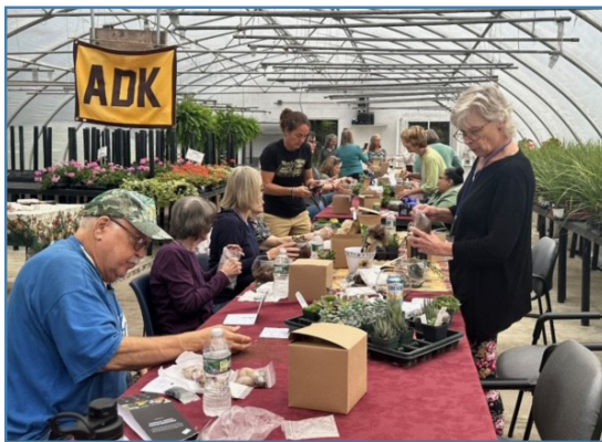
Terrarium Building – Creativity in Aging Workshop

In September 2024, Mercy Care for the Adirondacks hosted a Build and Learn Terrarium Workshop at Saranac Lake Hot House & Garden Center. Mercy Care Volunteers and Elder Friends gathered with members of the Lake Placid Garden Club for a terrarium-building workshop, with direction from the Hot House team, where they learned how to build and care for succulent terrariums.