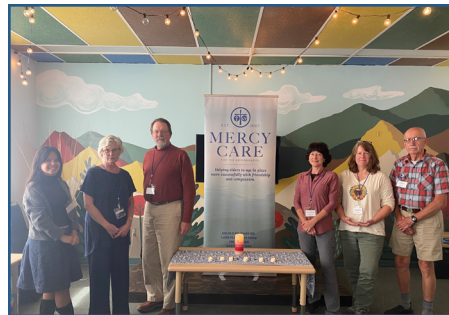
New Friendship Volunteers trained in Saranac Lake in October 2024