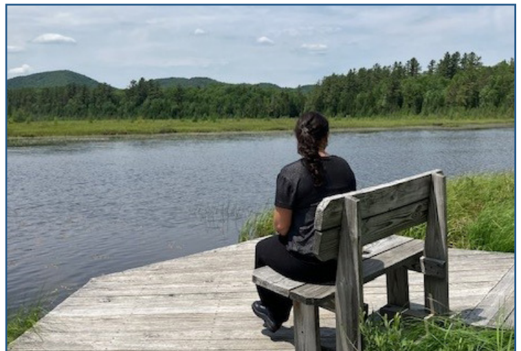
Reflection time at the 2024 Spirituality Retreat at Paul Smith's VIC