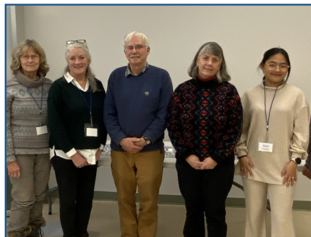
New Friendship Volunteers trained in Tupper Lake in January 2025