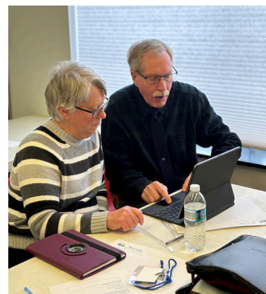
One-on-one instruction for iPads, tablets and cell phones.