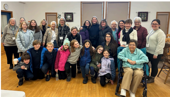
St. Bernard's 5th Grade with attending Elders and Friendship Volunteers.

Mercy Care Elders, Volunteers and St. Bernard's 5th & 4th Grade Students.