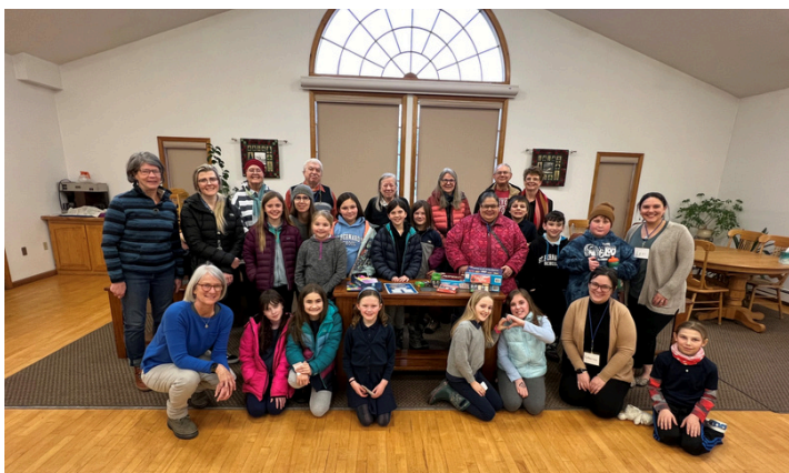
St. Bernard's 4th Grade with attending Elders and Friendship Volunteers.