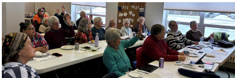
There were many questions asked, and answered, throughout the workshop.