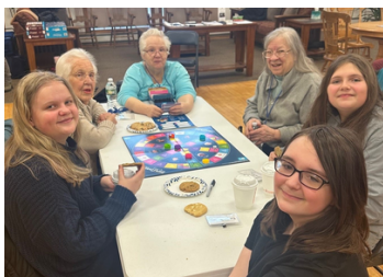
Elders and 5th Grade Students.