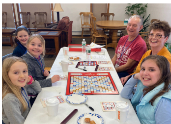
Elders and 4th Grade Students.