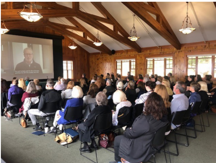
2023 Educational Forum